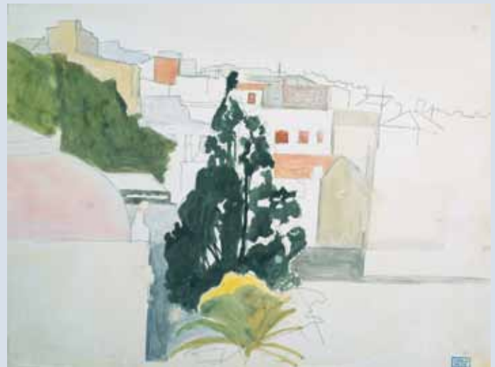
Joseph Stella Italian Landscape, 1920s or 1930s

John Divola (American, b. 1949), N34°09.967' W115°46.891' V2 , 1995–98. Giclée print from The George Eastman House 60th Anniversary Portfolio, 16 x 20 in. Purchased 2011 (2011.009.0002)